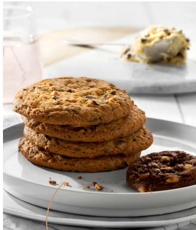
Chocolate Chip Cookie